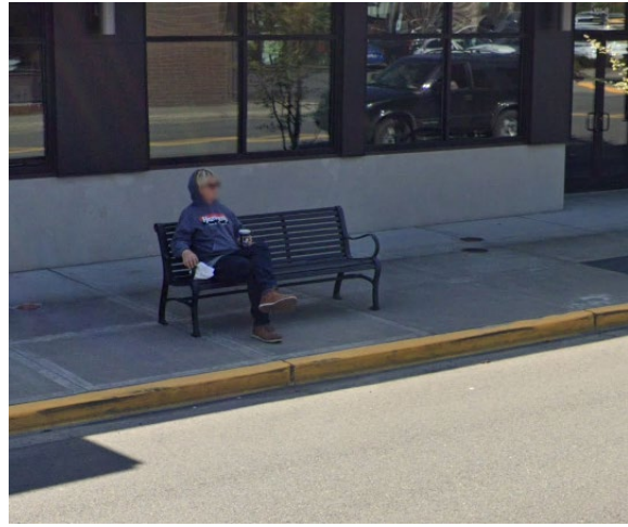
Existing bench to be matched (Park St. at Huxdotters)