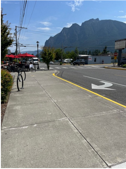
Proposed location (Main St. at Huxdotters)