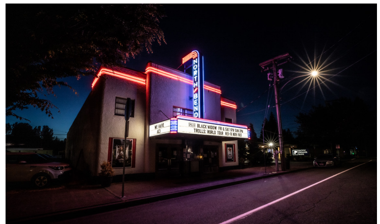
The historic North Bend Theatre, located at 125 Bendigo Blvd N

>> Future plans for the theatre involve the newly-formed non-profit, Friends of the North Bend Theatre, hosting an annual multi-day, multi-venue film festival and developing a thriving program for new filmmakers. And of course, everyone's secret wish....replace the seats!