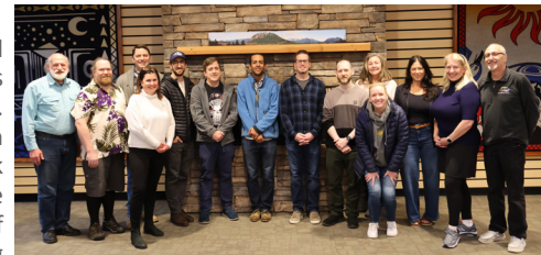
Citizens Academy grads with councilmembers

In April, we celebrated 17 North Bend Citizens Academy graduates. Now its second year in operation, the eight-week course guided people through various aspects of city operations, including administration and history, legal, public records and information, parks, finance, fire and police, public works and infrastructure, and community and economic development. Participants were deeply engaged in learning throughout the process, and we look forward to seeing how they choose to engage with the City moving forward.