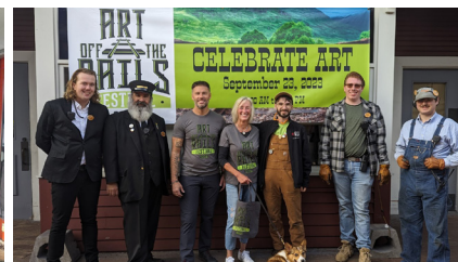
Sip Suds and Si and Art Off the Rails: two spring events that bring community

Community spirit and support for our local businesses and organizations is alive and growing here in our mountain town. I saw so many of you enjoying live music downtown at the JazzClubsNW's Jazz Walk in April, and businesses were packed last month at the North Bend Downtown Foundation's Sip Suds and Si event.