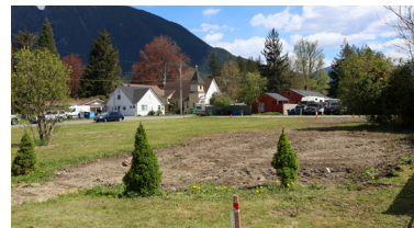
230 Main Avenue in North Bend

In addition to expanding outdoor recreation, we also continue our work in ensuring a diverse array of housing options here in North Bend. With the City's purchase of 230 Main Avenue, we are doing exactly that. The property will provide rental homes for local workers, affordable to families making not more than 60% of King County Average Median Income (AMI). With asbestos abatement and demolition of the two structures now complete, expect to see a Request for Proposals released this summer with proposals to the Council late this year.