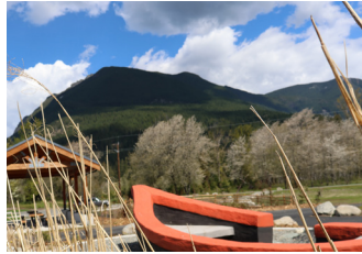
Dahlgren Family Park, open soon

Walking, biking or driving on Southeast North Bend Way, you have likely noticed continual activity just east of the Timberstone Condominium development. What you are seeing is Dahlgren Family Park, a four-acre space that will soon be open for mountain viewing, pickleball, volleyball, playground adventures, picnicking, and walking, with a new trail connection to King County's Tanner Landing Park. We are as eager as you are to get in there and test it out, but it's not quite ready yet. I am hopeful that by summer I will be wielding those giant scissors yet again and cutting that ribbon so that we can all fully enjoy another new city park.