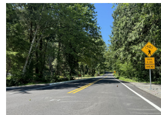
Ribary Way overlay project

Local road restoration is another integral part of annual infrastructure improvement, and this year's work is well underway. The pavement overlay project on Ribary Way is now complete, and overlays are expected to start on Ballarat Avenue and Cedar Falls Way later this summer.