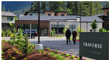
Traverse apartments, at 436 th Ave SE

And in May, I toured the now complete Traverse apartments, a new neighborhood at the corner of 436 th Ave SE and SE 136 th Street. Traverse offers 128 units along with a clubhouse and office space. Approximately 28 of the new apartments are designated as affordable housing for households earning 80% or less of the King County Area AMI. I enjoyed immersing myself in this new neighborhood and look forward to meeting more of you.