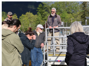
A WWTP tour in April 2024

In June, we will celebrate the completion of the Wastewater Treatment Plant (WWTP) High Priority Improvements. This critically important project raises our infrastructure to a whole new level of environmental standards by decreasing plant odor, improving safety, increasing the protection of the Snoqualmie River, and being prepared to accept new capacity. I invite you to tour the WWTP to see your taxpayer dollars hard at work! Please stay tuned for opportunities to visit.